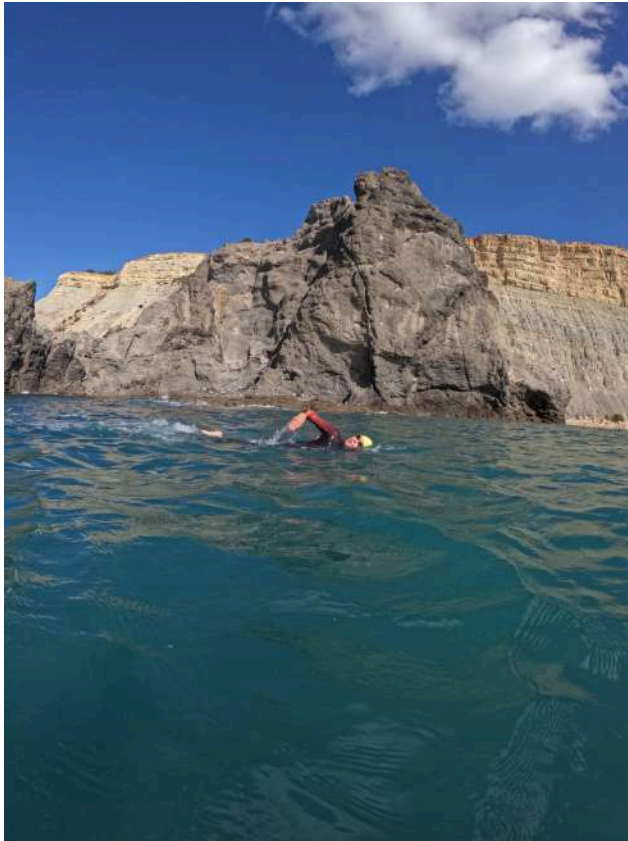
On the left - Praia da Luz Vulcano (70M years old)