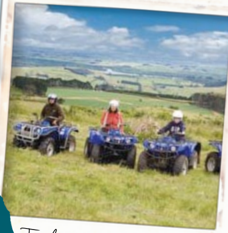
Time for some action on a Quad bike tour with Riverland Adventures

RIVERLAND ADVENTURES offer one, two or five hour quad bike safaris, across incredible scenery, allowing you to take in the river from a perspective you will not see from the boat, with views of river, farmland and forest right out to the Tasman Sea.