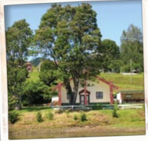
The Taurangani Marae can only be seen from the Waikato Riverland area

Whether you're looking for a fun day out, a team building exercise or simply a unique way to enjoy New Zealand's diverse countryside, Riverland Adventures offers a fun, safe and exciting selection of quad bike safaris. Experience authentic Maori culture and hospitality, enjoy New Zealand's beautiful landscapes and take in spectacular 360 degree views. All this can be enjoyed minutes from a special landing place we have identified.