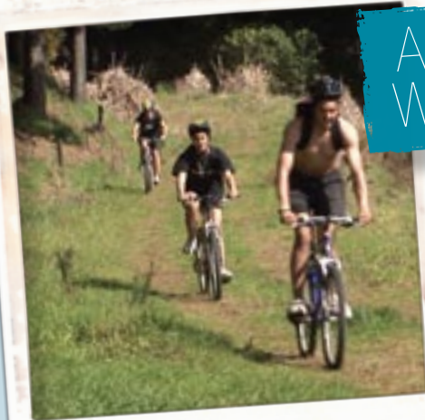
Mountain biking through one of the local forests.

Let us arrange a guided adventure. Activities vary, from scenic kayak trips to hot laps on a racing circuit, mountain biking, caving, abseiling and guided bush walks through beautiful native bush.