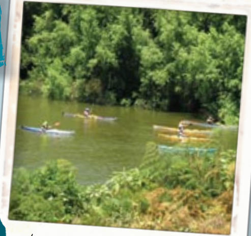
A guided tour makes all the difference, their level of knowledge is incredible.

They meet you literally at the stern of "Discovery 1" if you want to explore the Delta Region of the Waikato Riverland. Here you can paddle quietly between the islands and even get out and explore a few. This sheltered area of slow moving streams is home to many species of duck and shags (cormorants) plus native fantails, kingfishers, pukeko, and the Australasian bittern. These islands hide the dozens of duckshooters' maimais and whitebait stands that are inhabited by many keen locals during the open seasons. Rest at a maimai for lunch.