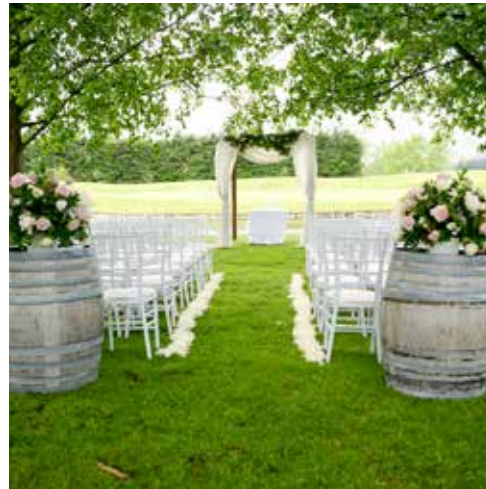
THE 4TH HOLE