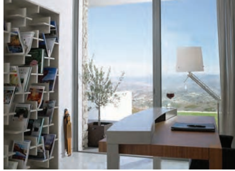
Rob Steul Woods Bagot

"Inspired by the traditional architecture we engaged the local Cypriot character with an uncompromisingly luxurious modern edge to create timeless designs."