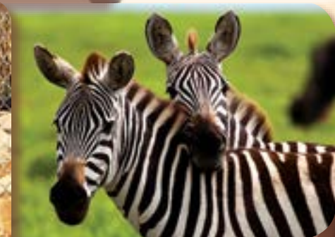
The striking Zebras