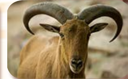
The cute and friendly sheep & goats

Within the grounds is a cafeteria that offers snacks, ice cream and drinks and is conveniently positioned right next to the children's playground so parents can take some time out.