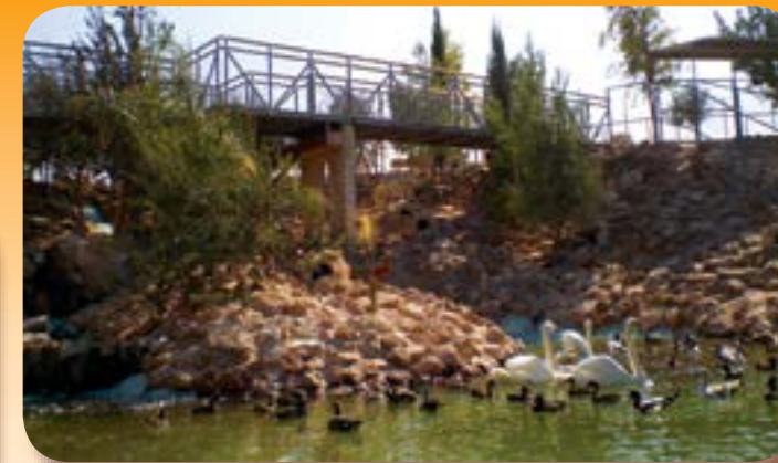
The Large variety of ducks, geese, swan, pheasant, partridge and chickens

The birds & animals are housed amongst trees, bushes and aromatic shrubs with paths that lead you in and around the park. The atmosphere that Melios has managed to create is filled with different emotions, excitement because you can't wait to see what the next bird or animal will be, the sounds that you can hear near and far, it's enjoyable, It's relaxing... so much so that you will not want to leave!!