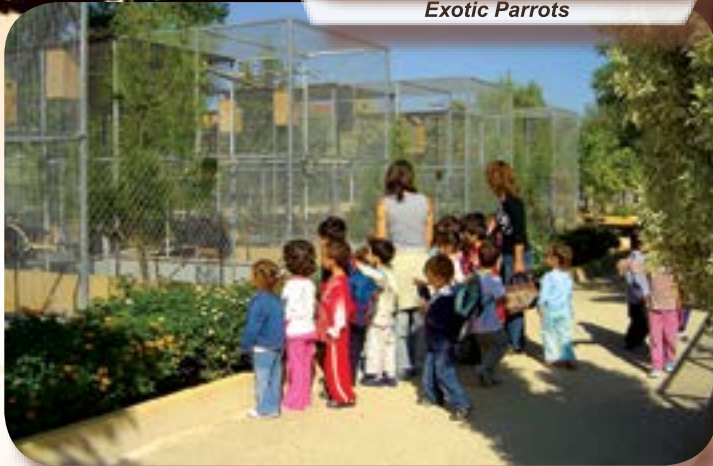
Melios Zoo welcomes schools, colleges & universities, scout groups and other organisations.