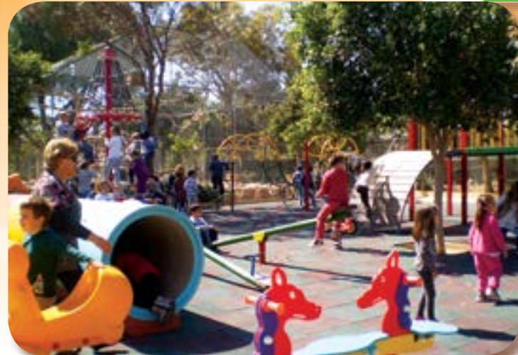
The Playground & The Cafeteria