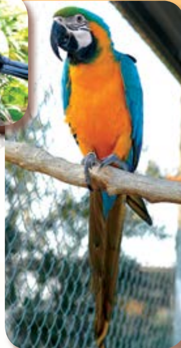
The Friendly Talking Parrots