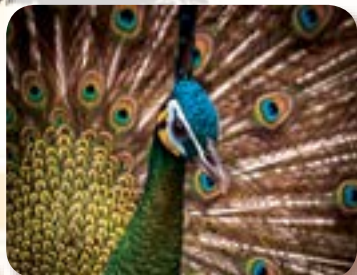
The beautiful peafowl