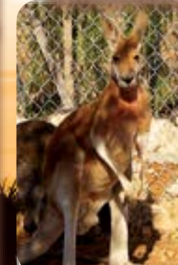
The long-legged Kangaroos

Within the grounds is a cafeteria that offers snacks, ice cream and drinks and is conveniently positioned right next to the children's playground so parents can take some time out.