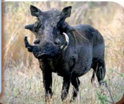
Warthog, Wild Pig