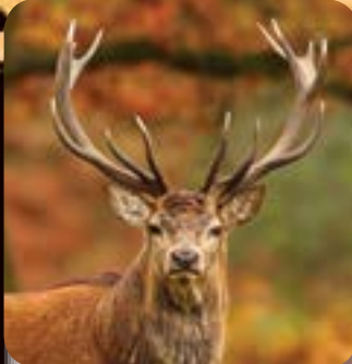
The call of the male deer