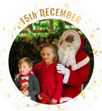
Santa Claus is Coming to Town again to collect your Christmas lists! Join us in the Live Lounge for plenty of games, singalong stories and prizes between 5-7pm.