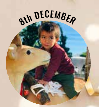
Santa Claus is Coming to Town to collect your Christmas lists! Join us in the Live Lounge for plenty of games, singalong stories and prizes between 5-7pm.