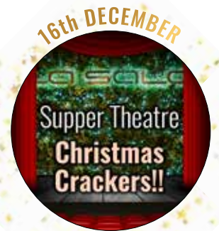
Curtain Up Productions present a fabulous festive edition of Supper Theatre. Christmas Crackers!! is guaranteed to bring you a delightful evening of good old-fashioned Christmas with plenty of surprises!