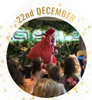
Santa Claus is Coming to Town one last time to collect your Christmas lists! Join us in the Live Lounge for plenty of games, singalong stories and prizes between 5-7pm.