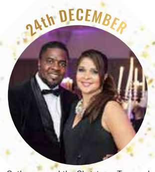
Gather around the Christmas Tree and embrace the most wonderful time of the year together, with a live performance from The Marbella Gospel Choir starting at 7.30pm. Complimentary Mince Pies available, so please arrive early!