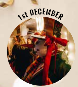
Official opening of the Sala Ski Lodge with Mulled Wine and a live performance from the Marbella Gospel Choir starting at 7.30pm.

Check out our action-packed calendar of events, with something for everybody to enjoy. Get looking, booking and let's celebrate together!