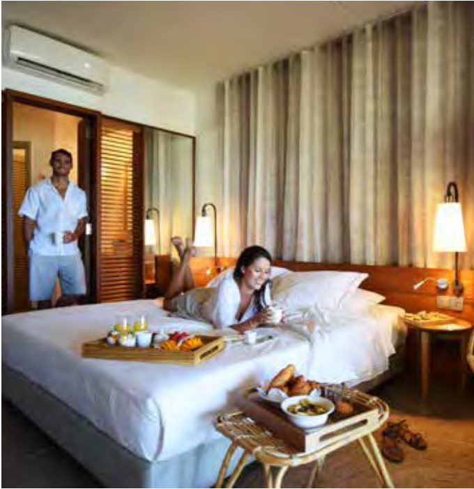
ALL DAY BREAKFAST IN ROOM