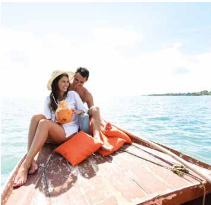
EMBARK FOR A PRIVATE CRUISE ON A TRADITIONAL PIROGUE