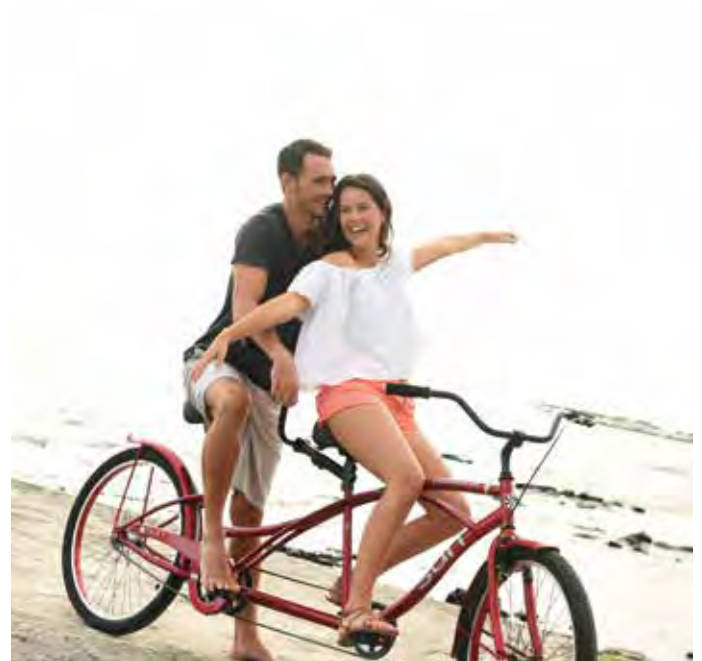
DISCOVER THE VILLAGE ON A TANDEM