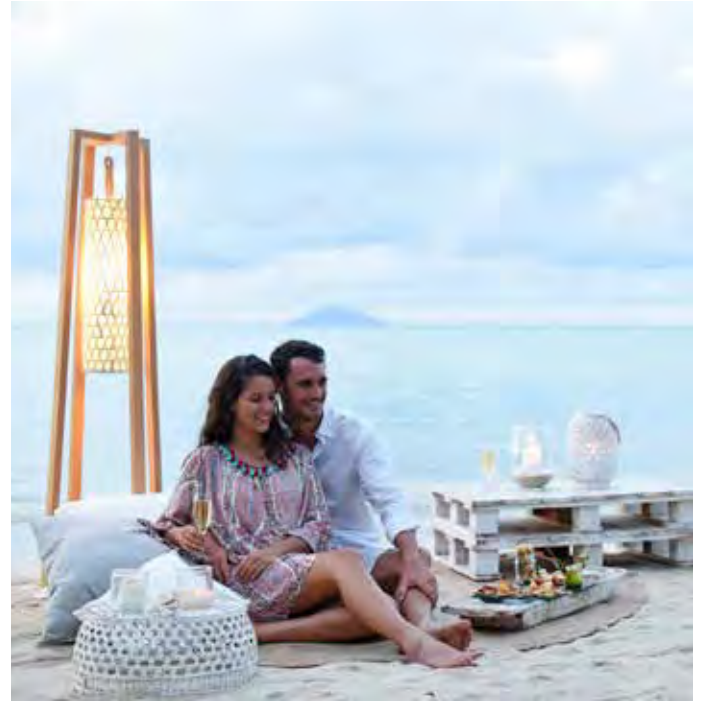
APERITO MOMENT ON THE BEACH