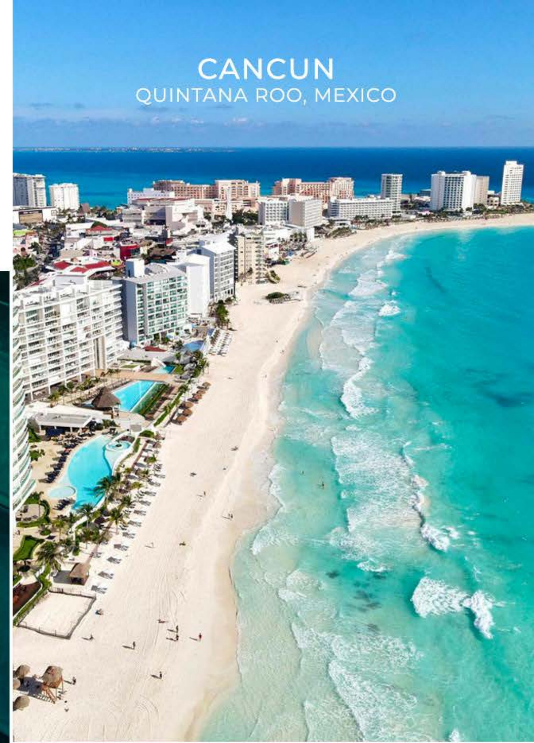
CANCUN QUINTANA ROO, MEXICO