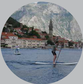
Stand Up Pedaling