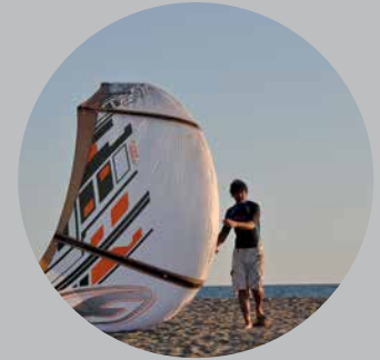
Wakeboarding and Waterskiing