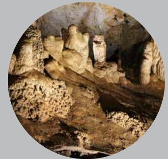
Caves: Mysteries of the Underworld