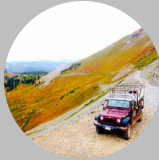
Off Road Adventure: Jeep Safari at Lovcen Mountain