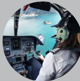
Scenic Boka Bay Helicopter Tour