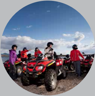
ATV Tour: Zabljak Crnojevica