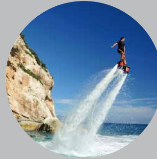
Water Sports in Budva