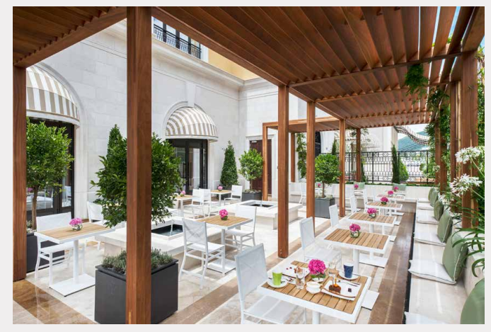
Secret Garden is an outdoor extension of our quintessential patisserie which is an ideal venue for an exclusive business breakfast or lunch meeting, with seating capacity for 70 guests.