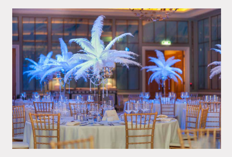
Teodo Ballroom is a beautiful space for up to 250 guests, offering splendid views of the marina with plenty of natural light. The function room is ideal for all types of events, from weddings to business conferences and more intimate dinner and drinks receptions.