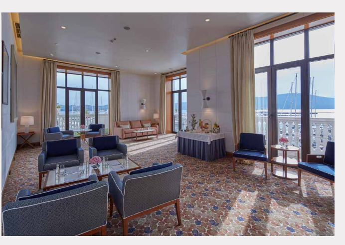
Regent Lounge is a multifunctional meeting space which can accommodate up to 60 guests in a theatre style or 80 guests for a reception. The Regent Lounge has its own bar where a buffet lunch and drinks can be served if required.