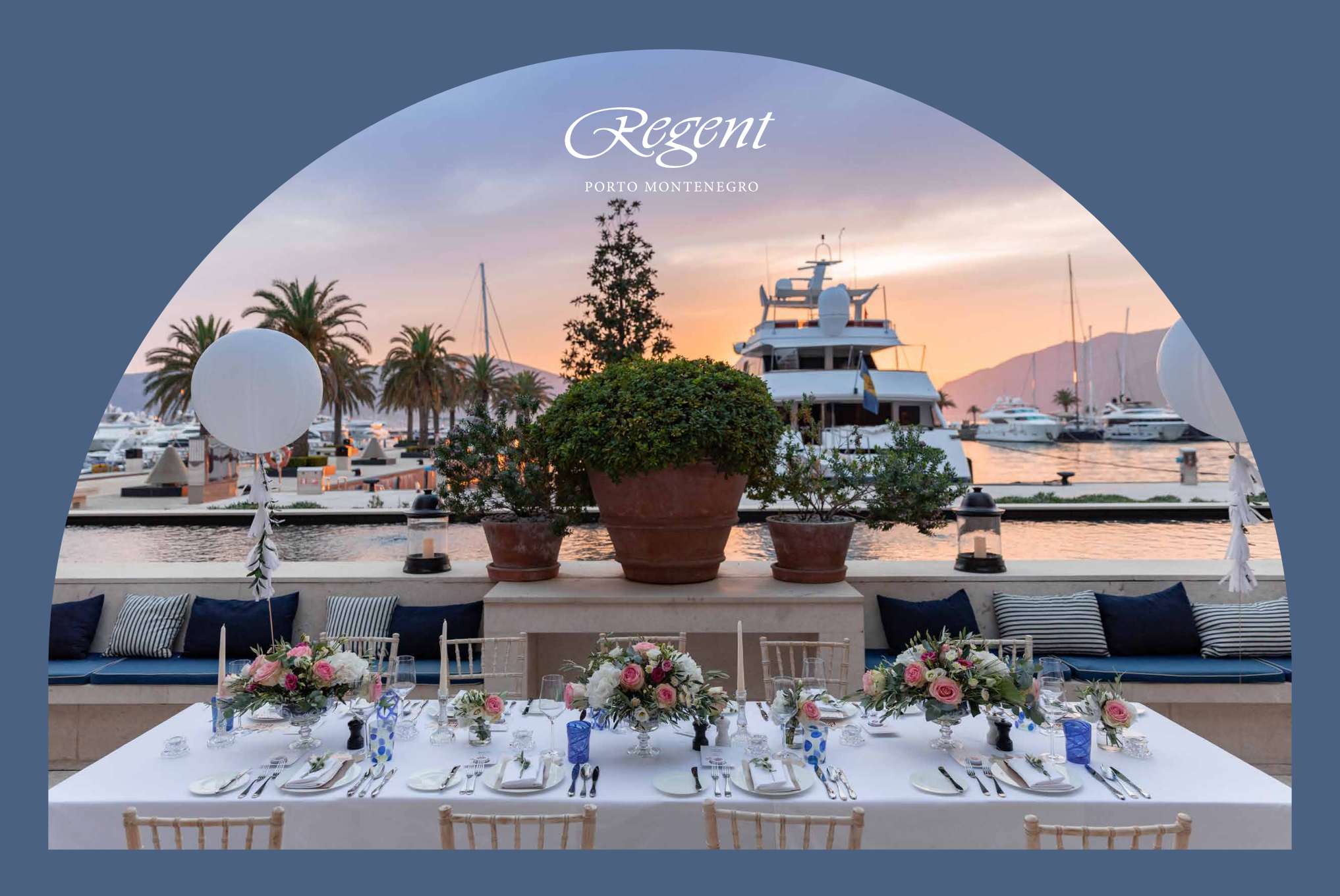
Meetings & Events