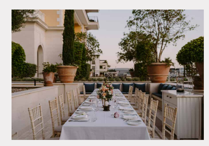
The Garden is a private, lushly landscaped island on the waterfront – a spectacular venue for special occasions and VIP events for up to 250 guests.