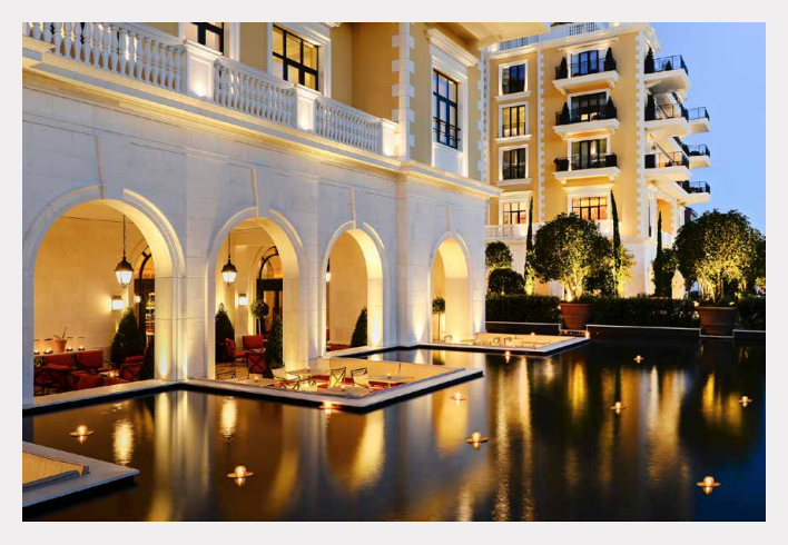
Library Bar Terrace overlooks the sea and its close proximity to Murano Restaurant means it is a fantastic venue for a cocktail reception with tapas and canapes. It can host up to 120 guests in cocktail style.