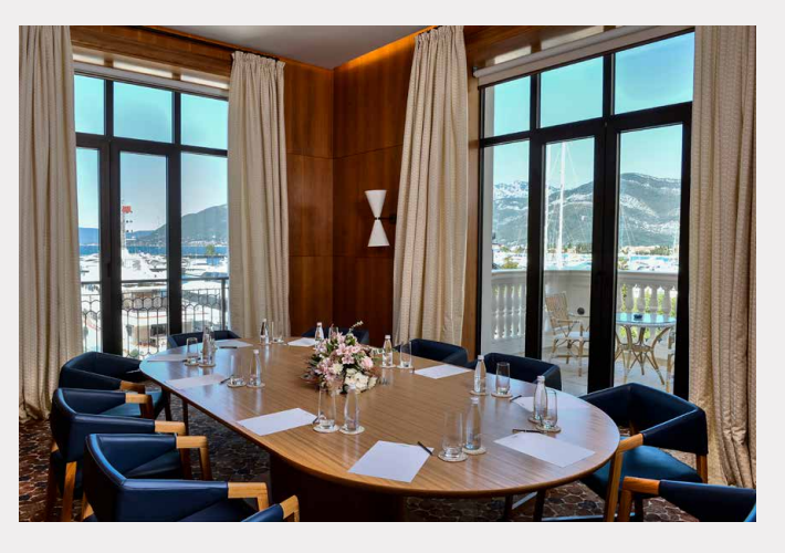
Salon Boka is the perfect place for meetings and intimate events for up to 12 people. It is equipped with modern technology overlooking the splendid landscape of Boka Bay and luxurious yacht marina Porto Montenegro.