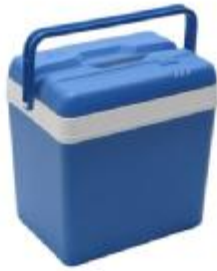
Plastic cool box: