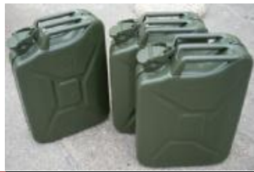
Diesel / Petrol canister: