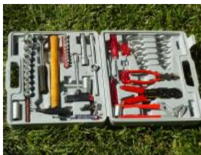
Extra tool box: