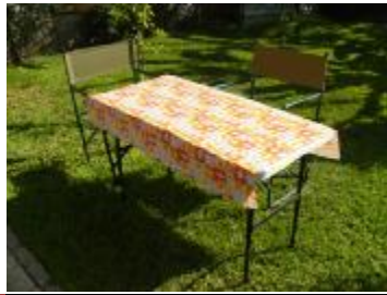
table and chairs: