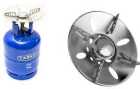
Gas bottle and gas cooker