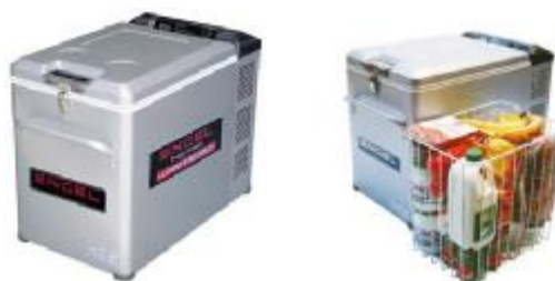
40L Engel compressor fridge