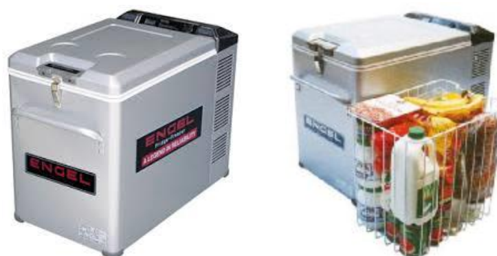
40L Engel compressor fridge