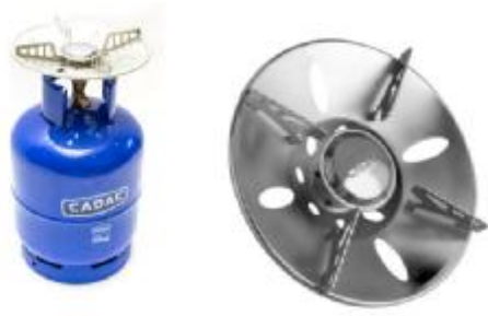
Gas bottle and gas cooker