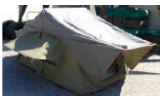
Standard-Roof top tent: 120 x 240 cm (when tent is open), Large Roof top tent: 140 x 240 cm (when tent is open)