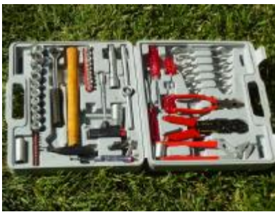
Extra tool box: