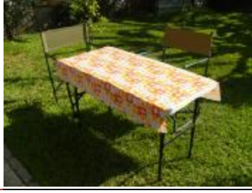
table and chairs: