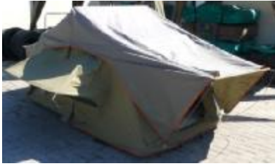
Standard-Roof top tent: 120 x 240 cm (when tent is open), Large Roof top tent: 140 x 240 cm (when tent is open)