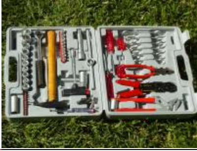
Extra tool box: