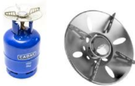
Gas bottle and gas cooker