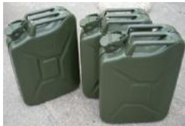
Diesel / Petrol canister: