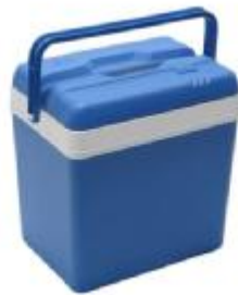
Plastic cool box: