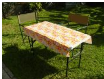
table and chairs: