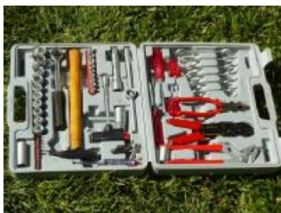
Extra tool box: