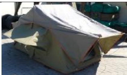
Standard-Roof top tent: 120 x 240 cm (when tent is open), Large Roof top tent: 140 x 240 cm (when tent is open)