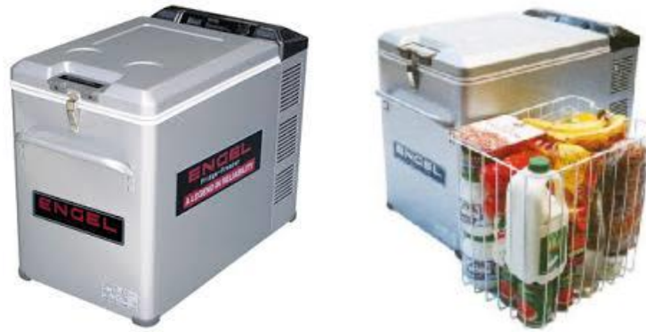
40L Engel compressor fridge