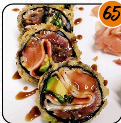
HOT SASHIMI ROLL ( 10 PIECES ) ( VARIETY OF FISH, CREAM CHEESE, AVOCADO, TEMPORIZED WAKAME AND EEL SAUCE ) ALLERGENS: FISH AND GLUTEN