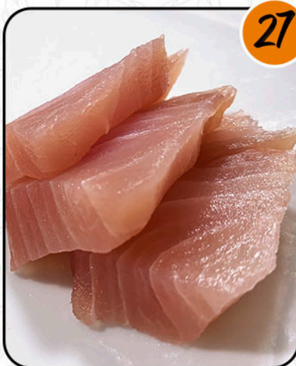
AMBERJACK ALLERGENS: FISH