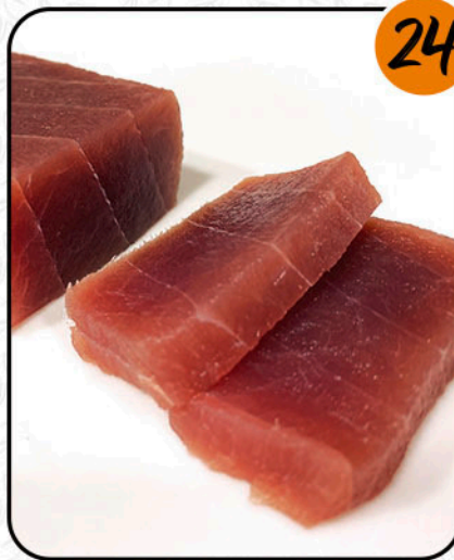
TUNA ALLERGENS: FISH