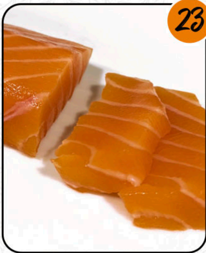
SALMON ALLERGENS: FISH