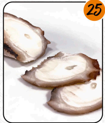
OCTOPUS ALLERGENS: MOLLUSCS