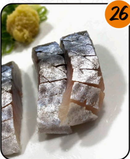
MACKEREL ALLERGENS: FISH