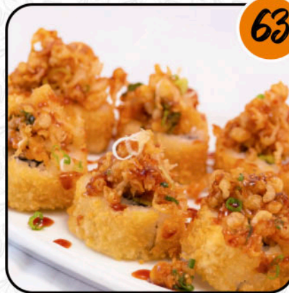
CRISPY ROLL ( 4 / 8 PIECES ) ( SURIMI, AVOCADO AND CREAM CHEESE ) · BREADED ROLLS - WITH TOPPING · ALLERGENS: FISH, SHELLFISH, MOLLUSCS, LACTOSE, GLUTEN, SOY, SESAME