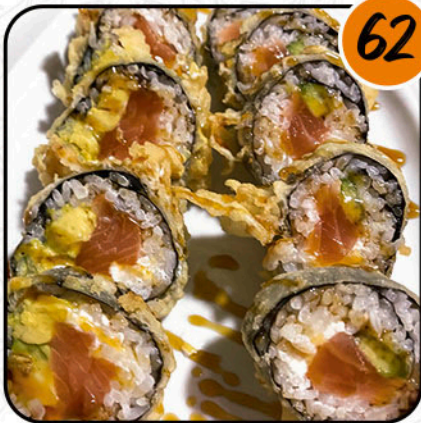
SALMON TEMPURA ROLL ( 5 / 10 PIECES ) ( SALMON, AVOCADO AND CREAM CHEESE ) · MINUTE ROLLS · ALLERGENS: FISH, LACTOSE, GLUTEN, SOY, SESAME