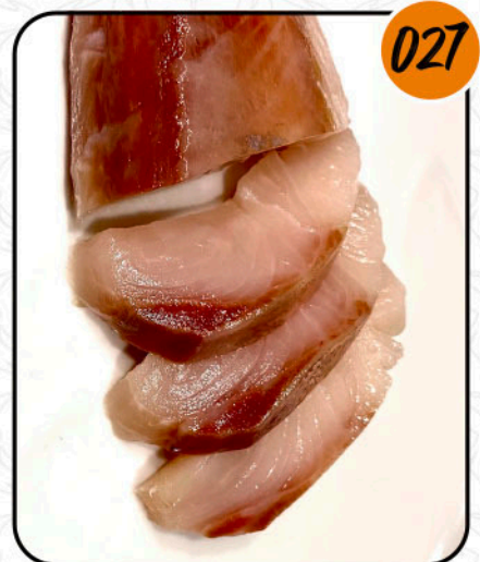
HAMACHI (JAPANESE FISH) ALLERGENS: FISH