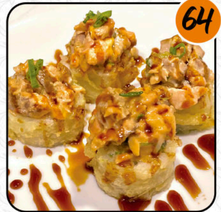
TEIDE ROLL ( 4 / 8 PIECES ) ( SALMON, TUNA, SURIMI, AVOCADO AND CREAM CHEESE ) · MINUTE ROLLS - WITH TOPPING · ALLERGENS: FISH, SHELLFISH, MOLLUSCS, LACTOSE, GLUTEN, SOY, SESAME