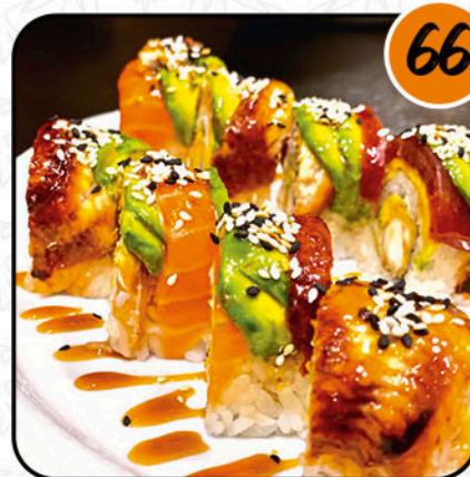
CRAZY ROLL ( 8 PIECES ) ( BREADED PRAWN, EEL, SALMON, AVOCADO AND EEL SAUCE ) ALLERGENS: FISH AND SEAFOOD