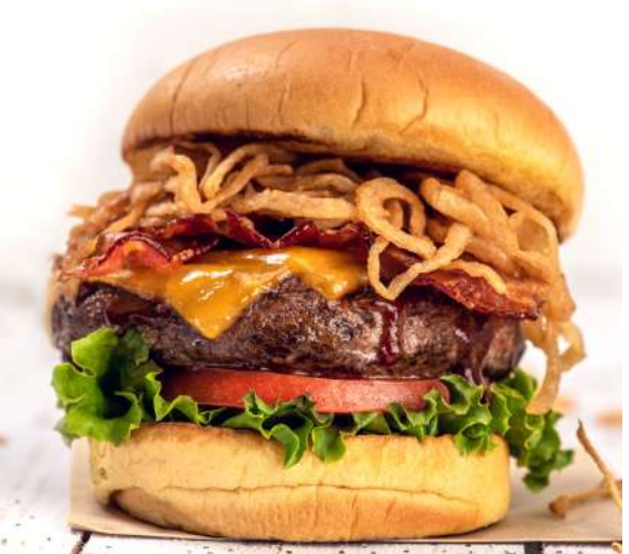
BBQ BACON CHEESEBURGER