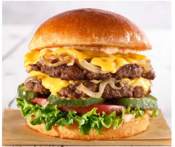
THE CLASSIC BURGER