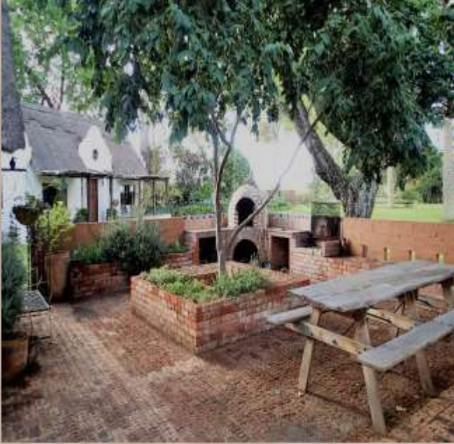
Herb Garden at Ngenile